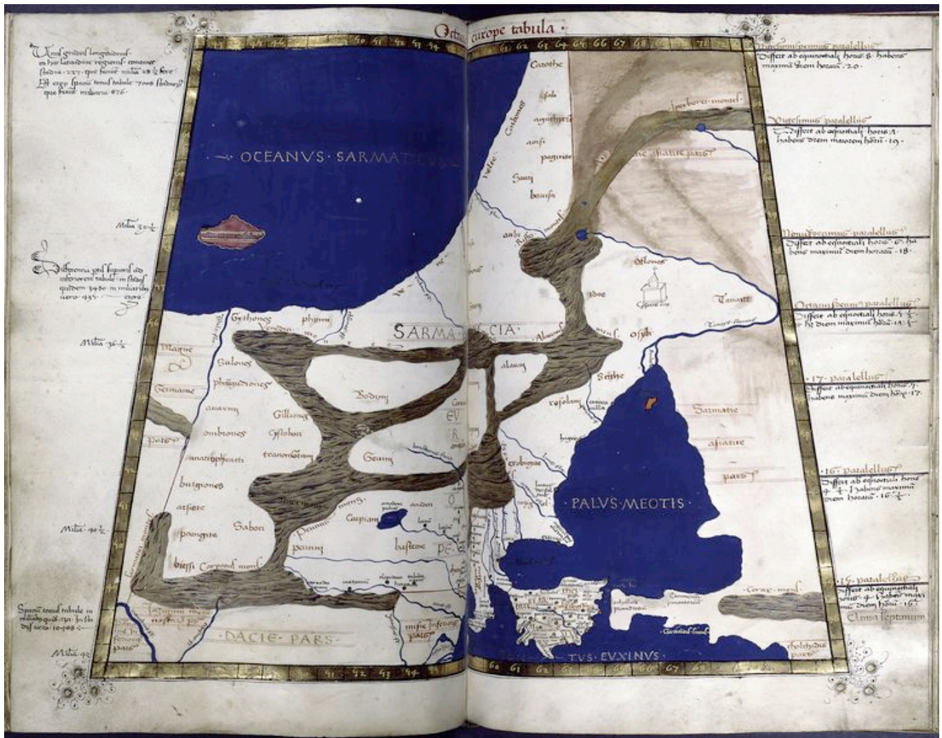
Image Title: Eighth map of Europe, in full gold border; Creator: Nicolaus Germanus, 15th cent. – Cartographer; Additional Name(s): Ptolemy, 2nd cent. – Author

High School Global History and Geography: Medieval History: Digital ID 427027